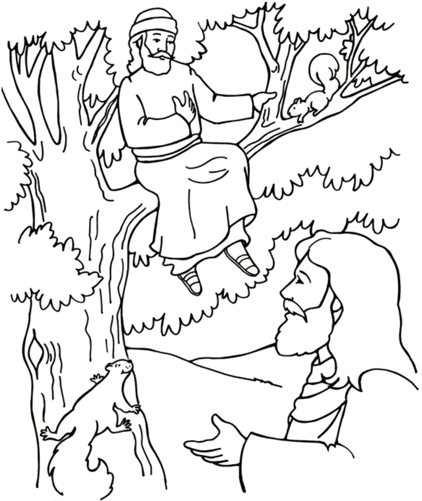
Jesus and Zacchaeus

When Jesus reached the spot, he looked up and said to him, "Zacchaeus, come down immediately. I must stay at your house today." Luke 19:5 (NIV)